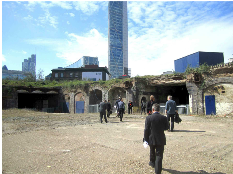
PHOTO TAKEN FROM NORTH EAST - The Oriel Gateway and adjacent arches are to be opened up to Shoreditch High St, allowing pedestrians to flow through.