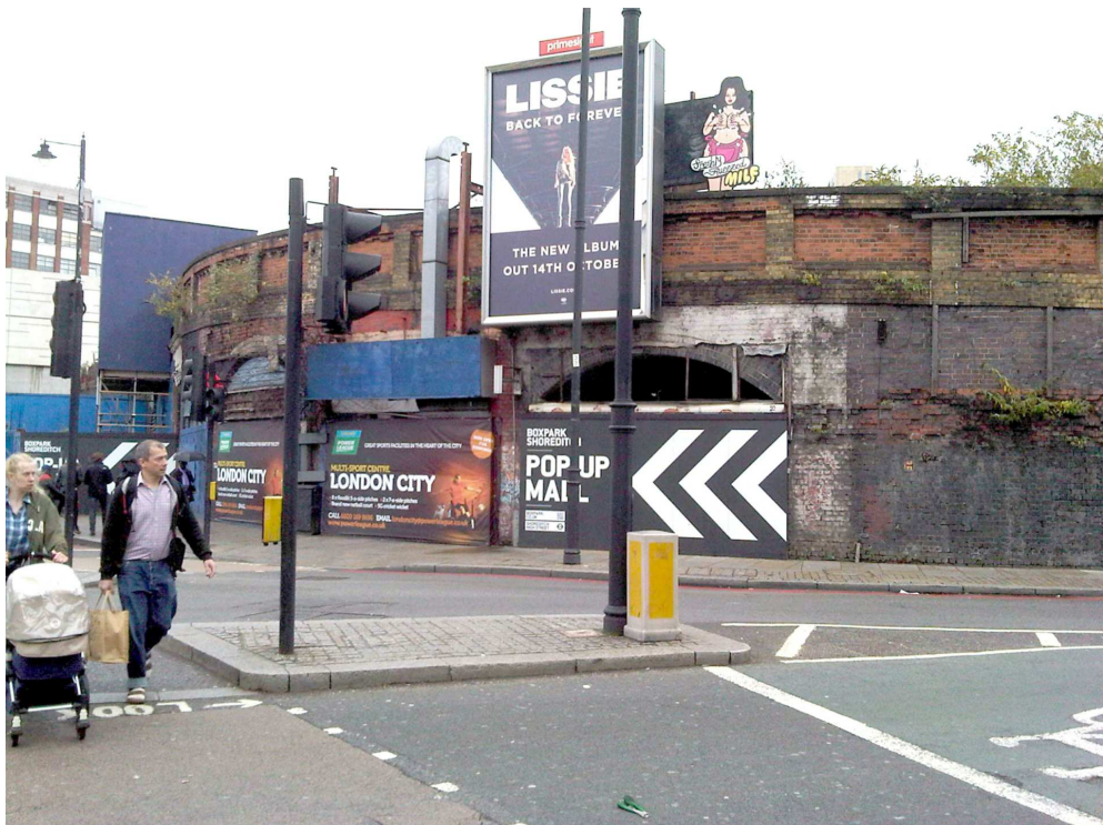
EXISTING SOUTH WEST CORNER - Brick arches are to be repaired and made good. Work include vegetation removal, repointing and replacement of badly spalled or missing bricks.