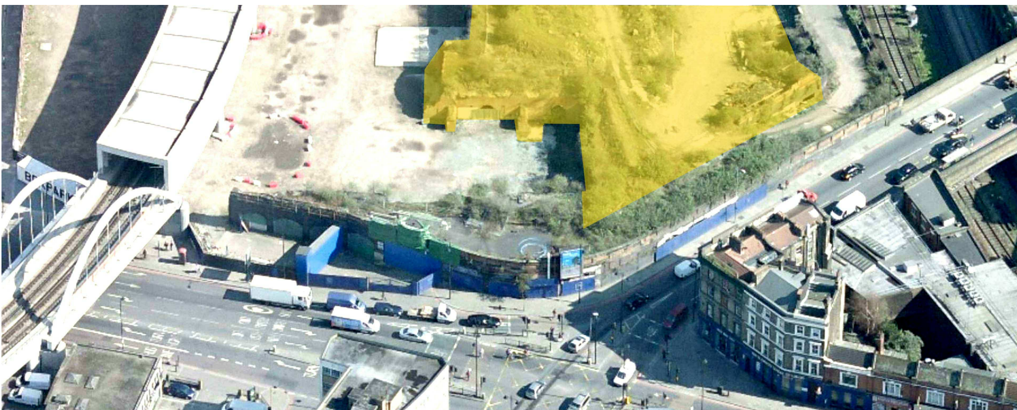
EXISTING BIRDS EYE VIEW FROM SOUTH WEST - Southern and Western Arches (highlighted yellow) are to be removed leaving the Oriel Gateway as a stand alone building.

Existing Brick Piers & Arches to be repaired & made good. Refer to Structural Engineers Specification for description of works.